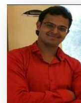
Contributed by CFA Nitin Agarwal Faculty RBMI, Bareilly.

These are major reforms undertaken in the money market in India. Apart from these, the stamp duty reforms, floating rate bonds, etc. are some other prominent reforms in the money market in India. Thus, at the end we can conclude that the Indian money market is developing at a good speed.